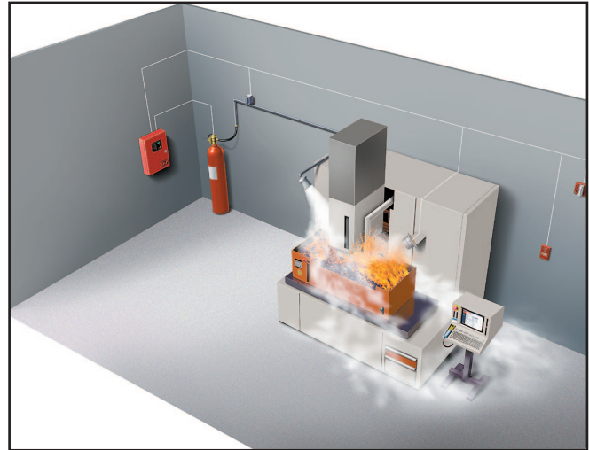
"Electronic Discharge Machine" Protected by a Fike Carbon Dioxide Suppression System

A Fike CO 2 system protecting an EDM process is shown in the illustration.